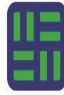
Tile & Grout Care

Call for a customized floor & textile Total Care Plan